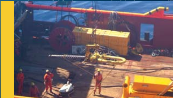
Balltec Ltd 415mT SWL 10" Pipeline Recovery Tool on the BP Thunder Horse PLET Restoration Project